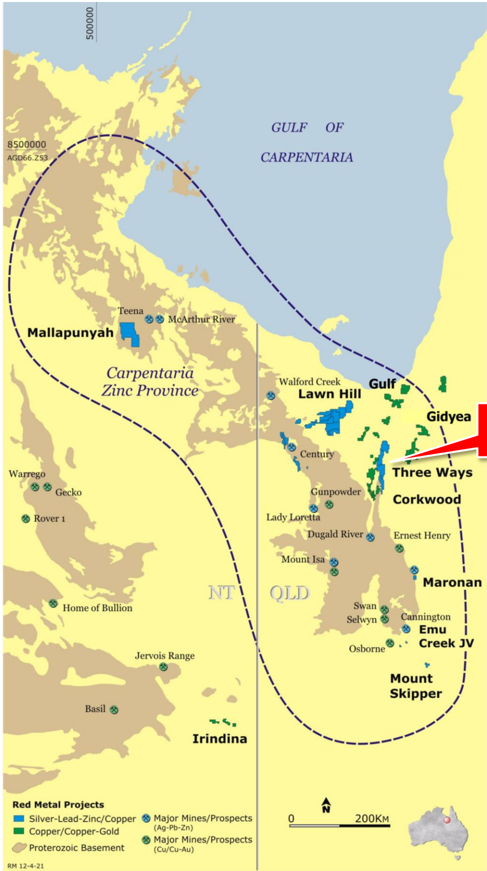
[Figure 2] Northwest Queensland and Northern Territory: Major deposits and Red Metal tenement locations.