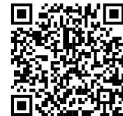
Scan QR Code using smartphone QR Reader App